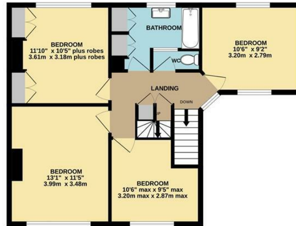
1ST FLOOR 640 sq.ft. (59.5 sq.m.) approx.