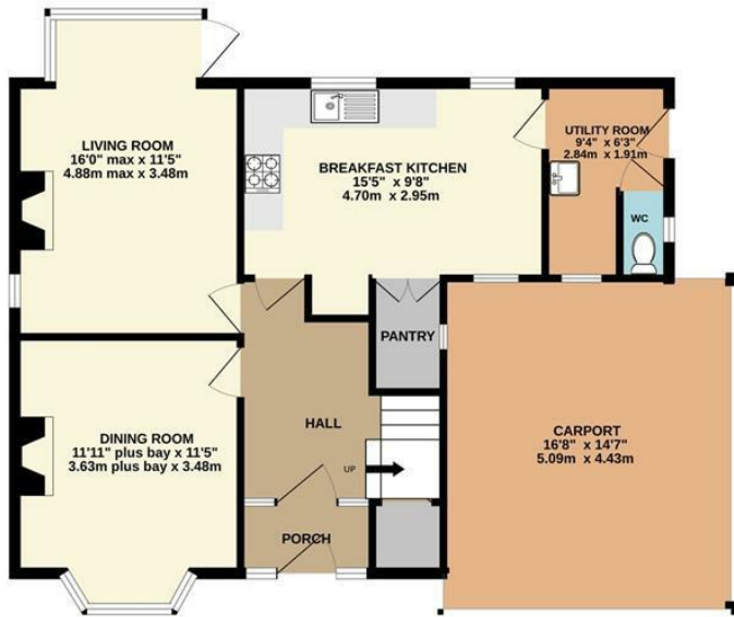
GROUND FLOOR 915 sq.ft. (85.1 sq.m.) approx.